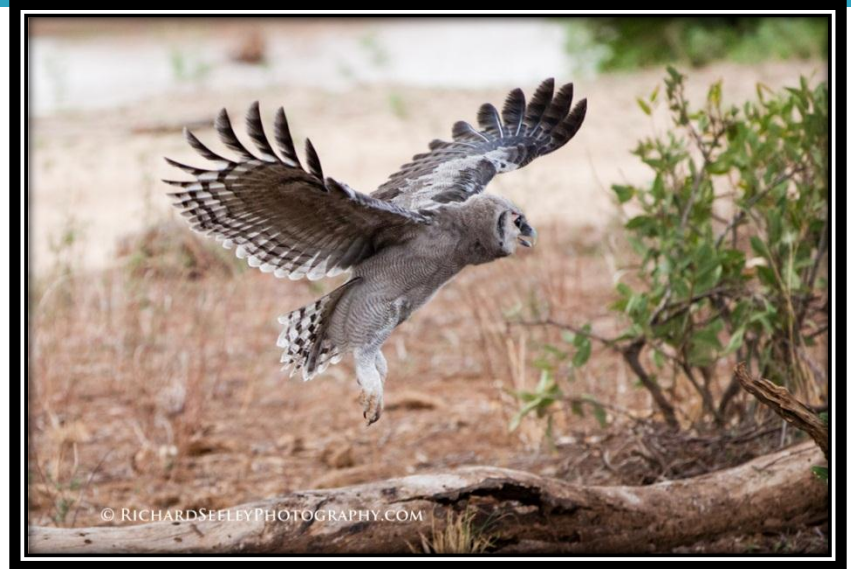
Practicing Flight Zoomed to 200mm