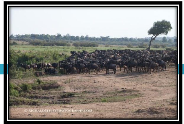
Herd Masses and Reaches Tipping Point