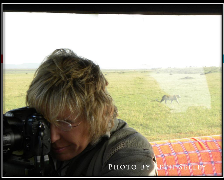
Must be Something Closer