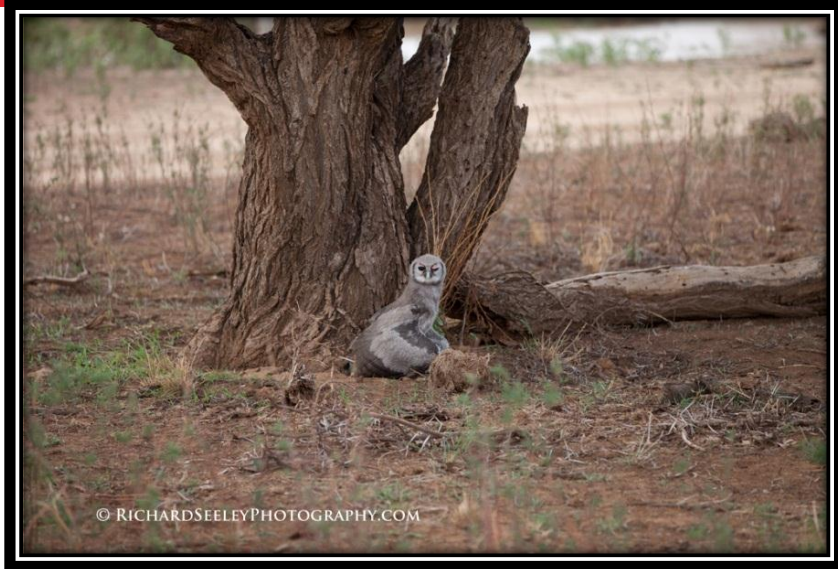
Verreaux Eagle Owlet Fledgling About 40 feet away