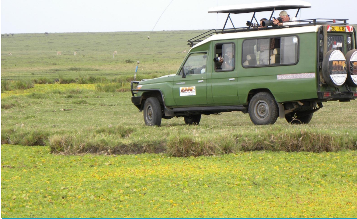
The Safari Vehicle