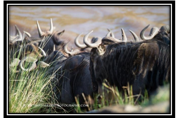
Plunging Into the River